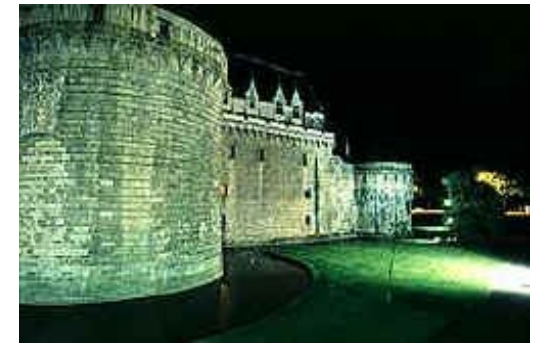
Castle of the Ducs of Bretagne in Nantes

You may be asked to take a placement test to determine which UW French level you are eligible for upon your return from the Nantes program.