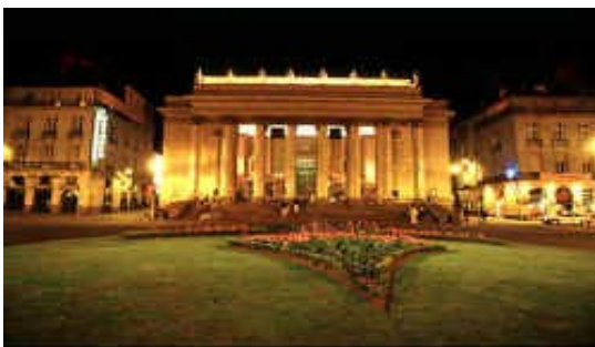
The Théâtre Graslin, Nantes's opera house

You will participate in excursions and various cultural events. Some of these activities will be offered and organized in fall semester by the UW on-site coordinator who will stay in Nantes for the first week of the program. A two-person team of local coordinators will be available for assistance and conversation classes throughout the semester.